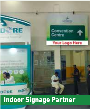
Indoor Signage Partner