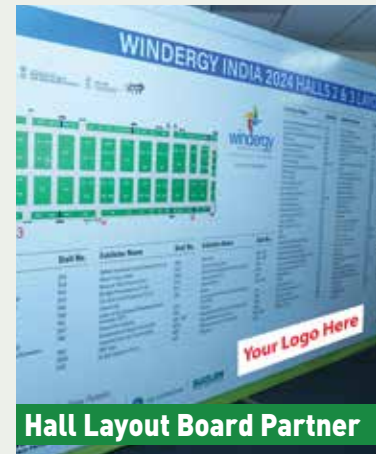
Hall Layout Board Partner