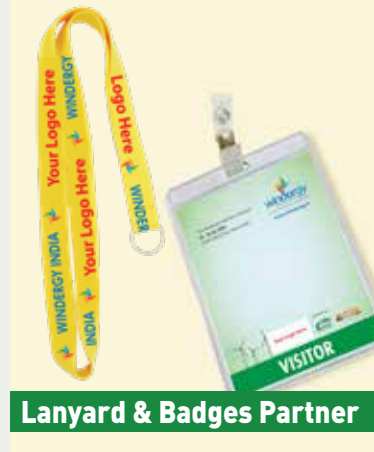
Lanyard & Badges Partner