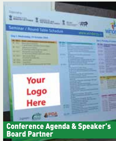
Conference Agenda & Speaker's Board Partner