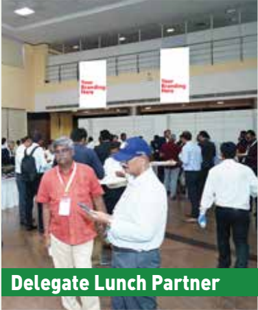
Delegate Lunch Partner