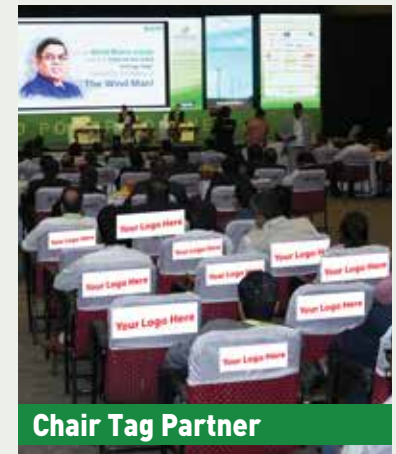
Chair Tag Partner