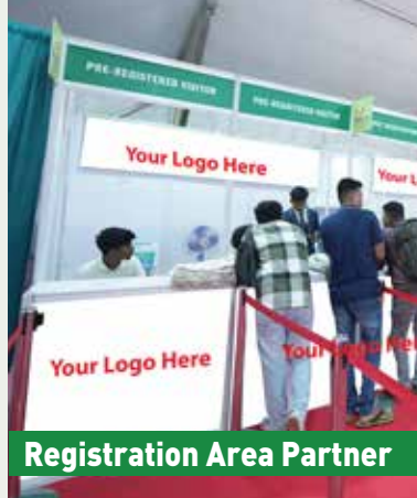
Registration Area Partner